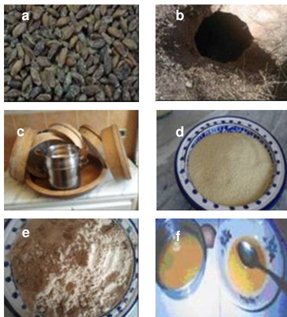
Figure 2. Utensils and Materials used: a: fermented wheat structure; b: entrance of “ Matmor ” silo c: Steam-cooker, Sieves and “ guassaâ ”; d: White couscous; e: semolina of “ dkak ”; f: eggs and “ smen ”

couscous, in forcing the grains by hand pressure, in order to pass through the sieve (Figure 3b). The sieving was performed with the sieve “ Mâaoudi ” (Figure 3c), for separate the couscous and non-aggregated particles. These have been put in the “ guassaâ ” to undergo a new cycle.