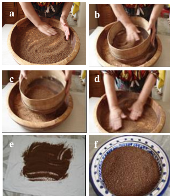
Figure 3. Steps principals used for manufacturing process of couscous “ Lemzeiet ” according to the traditional procedure of Constantine region. a: aggregating step (circular movement); b: sizing process; c: sieving process; d: finishing step (to and fro movement); e: Rest period; f: couscous “ Lemzeiet ” after cooking and drying

evaluated using standard techniques of the French Association for Standardization (AFNOR, 1991). The results are expressed in g per 100 g of product after the drying step, on mean of six trials.