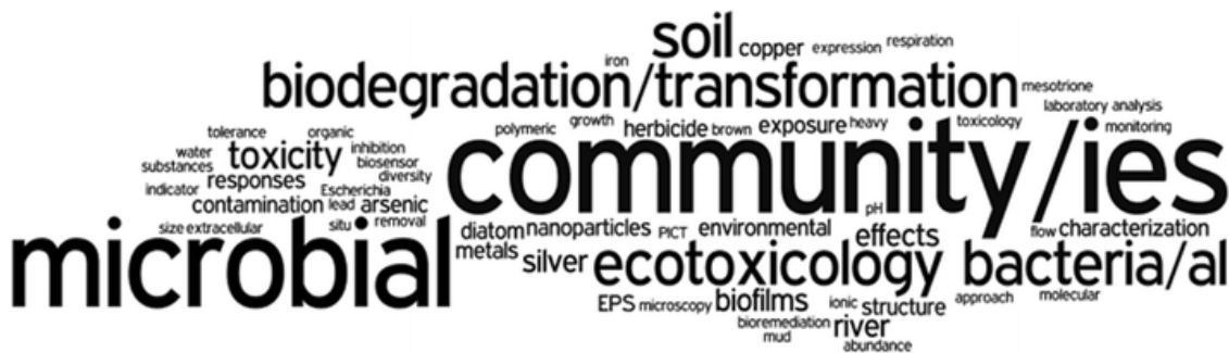
Fig. 2. Word cloud generated by Wordle ( http://www.wordle.net/ ) using the most frequent 60 words in the titles and keywords of the 'microbial ecotoxicology' special issue articles. Words used in both title and keywords were only considered once in the Wordle analysis

Possibly, one of the originality of microbial ecotoxicology lies in the role of microorganisms in the ecodynamic of the pollutants, which is not strictly taken into account in ecotoxicology. Microbial contamination can occur by accidental introduction of infectious microorganisms (bacteria, yeast, mould, fungi, virus, prions, protozoa) or their toxins and by-products in the environment (Proft 2009). Inversely, microorganisms present the capability to cope with chemical and/or biological contaminants to restore polluted sites. Bioremediation uses mainly microorganisms to clean up contaminated environments, involving biotransformation and biodegradation by transforming contaminants to non-hazardous or less hazardous chemicals (Alexander 1999). Natural communities of microorganisms in various habitats have an amazing physiological versatility, being able to metabolize and often mineralize huge number of molecules.