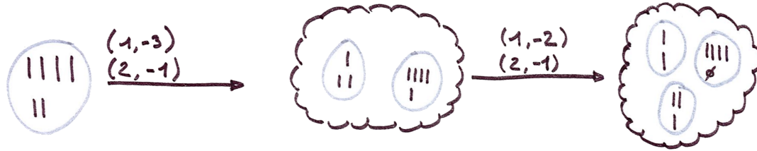
Figure 1: Two superposed moves played on a game of Nim.