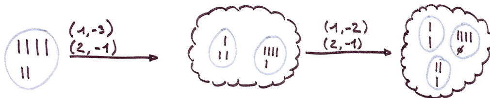
Figure 1: Two superposed moves played on a game of Nim.

From a classical game, we define a Quantum variation of the game (that can be seen as a modified ruleset) where players have to play Q-moves. A Q-move consists in a superposition (seen as a set) of classical moves. If the Q-move is reduced to a single classical move, we call it an unsuperposed move . As soon as a superposition of moves is played, the game is said in Quantum state . For each sequence of Q-moves, a run is a choice of a classical move among each superposed move of the sequence. If the choice forms a legal sequence of moves in the corresponding classical game, then the position obtained after this run is called a realisation of the game. For example, in Figure 1, two superposed moves are played on a game of Nim, leading to only three realisations, since the sequence (1,3)-(1,2) is not legal.