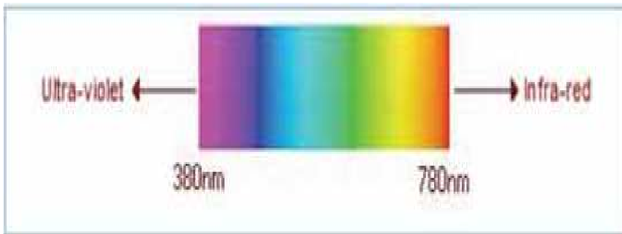
Figure1: Visible spectrum

Light is a form of energy manifesting itself as electromagnetic radiation and is closely related to other forms of electromagnetic radiation such as radio waves, radar, microwaves, infrared and ultraviolet radiation and X-rays. The only difference between the several forms of radiation is in their wavelength. Radiation with a wavelength between 380 and 780 nanometres as shown in figure 1 forms the visible part of the electromagnetic spectrum, and is therefore referred to as light.