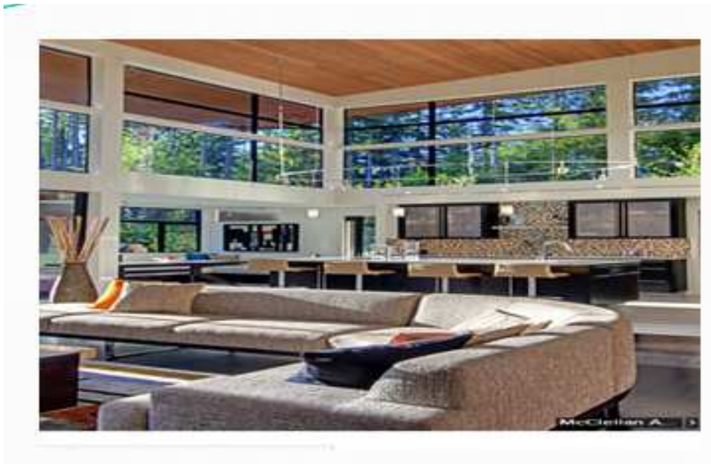
Figure 3: Typical Daylighting Architectural Design.

of a place in order to achieve adequate lighting levels in the interior for visual performance. “It is light that can make a building bright and airy or dull and gloomy”. Daylighting can contribute immensely in the saving of electrical power in buildings because the electrical power that would be consumed in Cathedrals like Gothic Cathedral can better be imagine. According to Abdulsalam et al. (2014) introducing natural light into buildings saves energy and also creates an attractive environment that improves the well-being of its occupants. The provision of effective daylight in buildings can be assessed using average daylight factors and by ensuring that occupants have a view of the sky. The average daylight factor will be influenced by the size and area of windows in relation to the room, the light transmittance of the glass, the brightness and colour of the internal surfaces and finishes, the depth of reveals, and the presence of overhangs and other external obstructions which may restrict the amount of day lighting entering the room. Chan and Tzempelikos (2015) in their findings pointed out that the integrated thermal and daylighting model shows the benefits of multifunctional façade concepts. The most significant benefit comes from lighting energy savings, also associated with the reduction of cooling load due to the decrease in internal heat gain. A typical daylighting architectural design is shown in Figure 3.