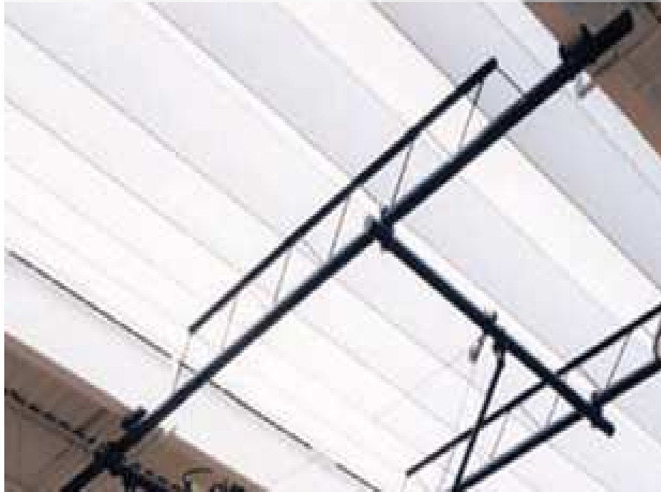
Figure 4: Daylighting proposal for multipurpose auditorium