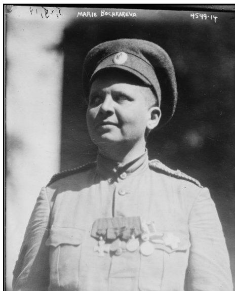
Maria Bochkareva, the Battalion of Death.

The Women's Battalion of Death was founded by Maria Bochkareva in 1917 - after the February Revolution, and after having convinced Alexander Kerensky (the new leader of the Russian Provisional Government) to form a women's battalion. The battalion initially consisted of 2,000 women, but it ended up with only 250 women, due to Bochkareva's strict rules and discipline. The battalion was employed on the border with the Austrian Front. While leading her battalion Maria was promoted to Lieutenant and then Captain. Maria Bochkareva was arrested many times by the Bolsheviks, when she was finally granted a passport and traveled to the United States by steamship in 1918.