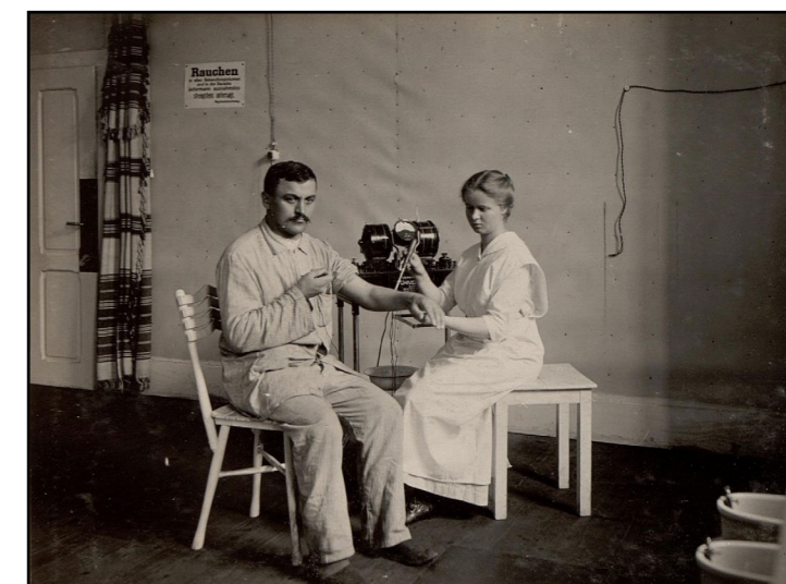
Faradisation in the Red Cross Hospital in Villach

The organization was initially established under the auspices of a British organization, the London Committee of the French Emergency Fund, but became independent in December 1915. Committees in eighty United States municipalities raised funds for the organization, which worked closely with several similar organizations, notably the American Committee for Devastated France and the American Red Cross. The Fund's mission was to provide medical assistance for wounded French soldiers and civilians, and other forms of support for refugees.