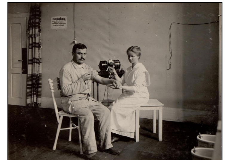
Faradisation in the Red Cross Hospital in Villach

The organization was initially established under the auspices of a British organization, the London Committee of the French Emergency Fund, but became independent in December 1915. Committees in eighty United States municipalities raised funds for the organization, which worked closely with several similar organizations, notably the American Committee for Devastated France and the American Red Cross. The Fund's mission was to provide medical assistance for wounded French soldiers and civilians, and other forms of support for refugees.