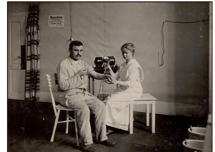
Faradisation in the Red Cross Hospital in Villach

The organization was initially established under the auspices of a British organization, the London Committee of the French Emergency Fund, but became independent in December 1915. Committees in eighty United States municipalities raised funds for the organization, which worked closely with several similar organizations, notably the American Committee for Devastated France and the American Red Cross. The Fund's mission was to provide medical assistance for wounded French soldiers and civilians, and other forms of support for refugees.