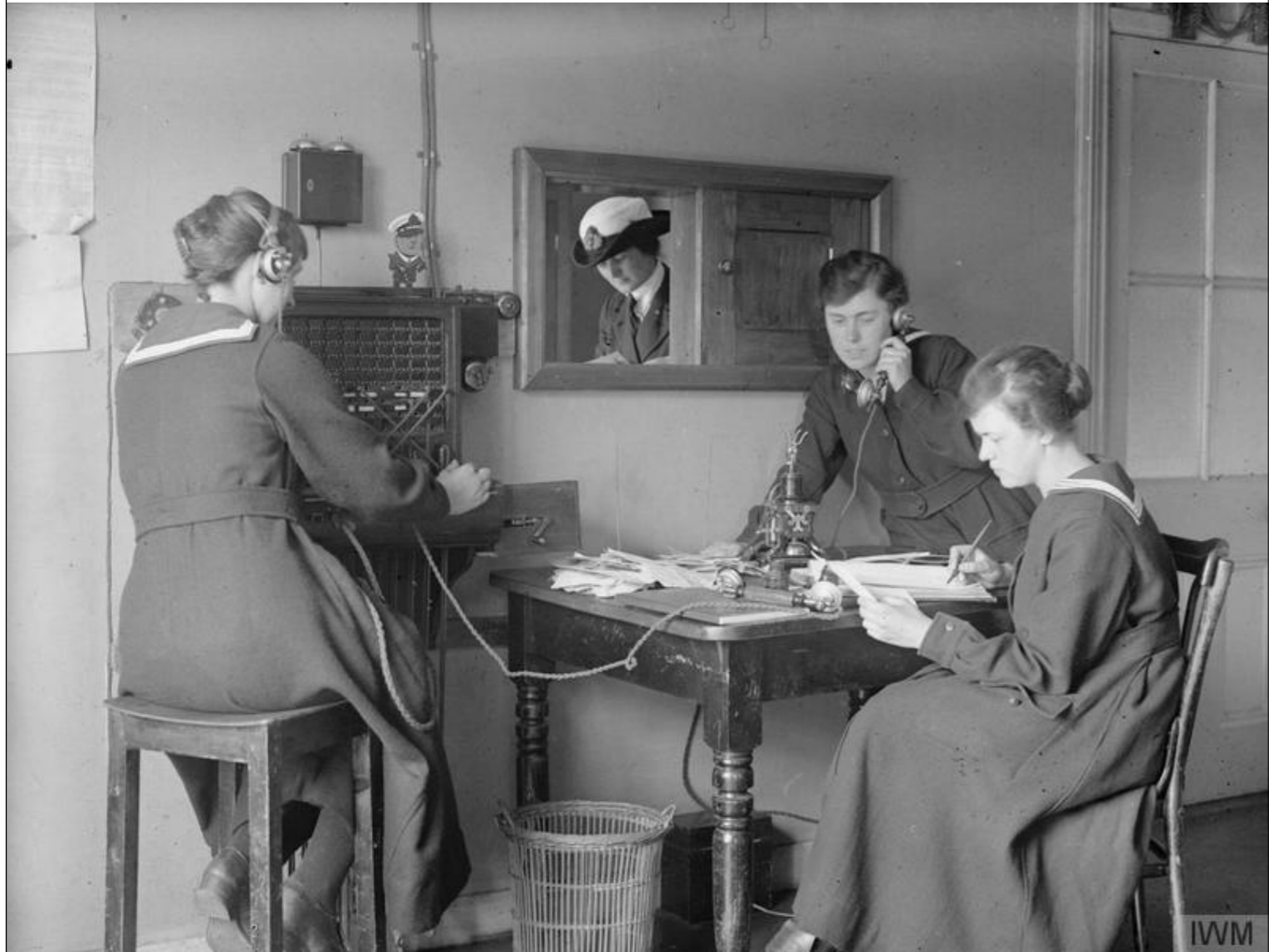
Telephonists at the naval exchange, Ipswich.