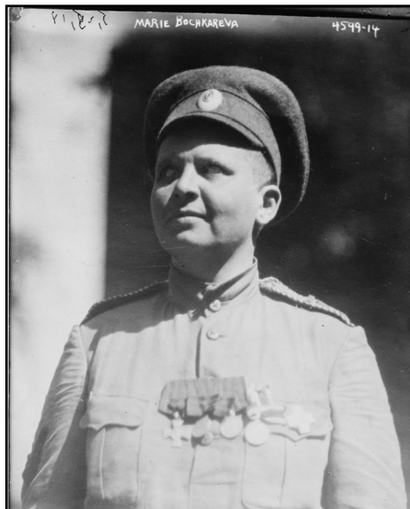
Maria Bochkareva, the Battalion of Death.

The Women's Battalion of Death was founded by Maria Bochkareva in 1917 - after the February Revolution, and after having convinced Alexander Kerensky (the new leader of the Russian Provisional Government) to form a women's battalion. The battalion initially consisted of 2,000 women, but it ended up with only 250 women, due to Bochkareva's strict rules and discipline. The battalion was employed on the border with the Austrian Front. While leading her battalion Maria was promoted to Lieutenant and then Captain. Maria Bochkareva was arrested many times by the Bolsheviks, when she was finally granted a passport and traveled to the United States by steamship in 1918.