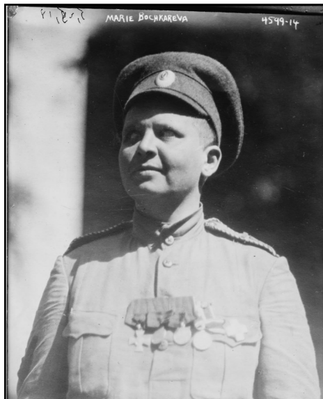
Maria Bochkareva, the Battalion of Death.

The Women's Battalion of Death was founded by Maria Bochkareva in 1917 - after the February Revolution, and after having convinced Alexander Kerensky (the new leader of the Russian Provisional Government) to form a women's battalion. The battalion initially consisted of 2,000 women, but it ended up with only 250 women, due to Bochkareva's strict rules and discipline. The battalion was employed on the border with the Austrian Front. While leading her battalion Maria was promoted to Lieutenant and then Captain. Maria Bochkareva was arrested many times by the Bolsheviks, when she was finally granted a passport and traveled to the United States by steamship in 1918.