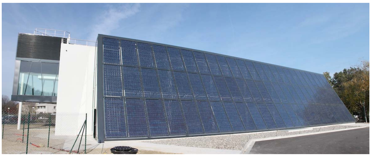
Fig. 1. The Georges Giralt Building: The Photovoltaic Main Windowed Façade