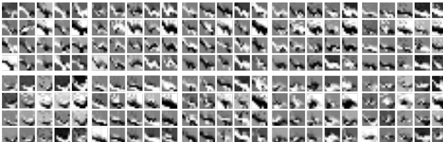
Fig. 3. The resulting kernels from the first filter grouped together for each posture from the REHAP data set (compare with Figure 2). The first layer of the CNN produces 20 different kernels. All 20 kernels produced per gesture are grouped and presented in analogous order from left to right, top to bottom.

We evaluate our approach on the REHAP [5] data set consisting of 600.000 data samples obtained from 20 different persons, each posing for 10 different hand gestures (cf. Figure 2). Each of the gestures is represented by 3.000 snapshots summing up to 30.000 data samples per person. This would result in the