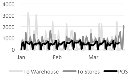
Figure 1: ‘POS’ reflects what the demand to the consumers, ‘to stores’ reflects what have been delivered from the warehouse to the stores, and ‘to warehouse’ reflects what have been delivered from the suppliers to the warehouse. There is a clear sign of varying demand, especially to the stores and to the warehouse.

table 2 show the lead time compression and the shelf life restrictions impact delivery frequency, though the impact depends on the localization and the size of the store.