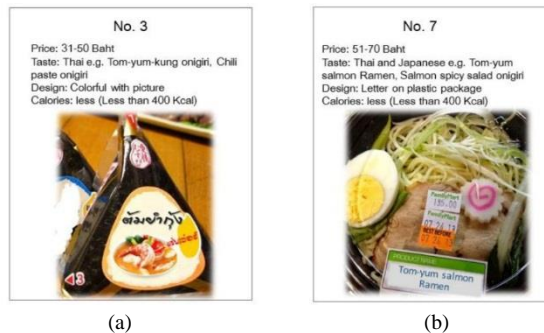
Fig. 1. Examples of conjoint cards (a) adapted from http://www.catdumb.com (b) adapted from www.quitecurious.com