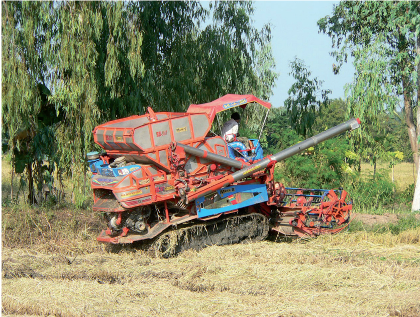
Fig. 2. A harvester-thresher, Ban Han, 2014