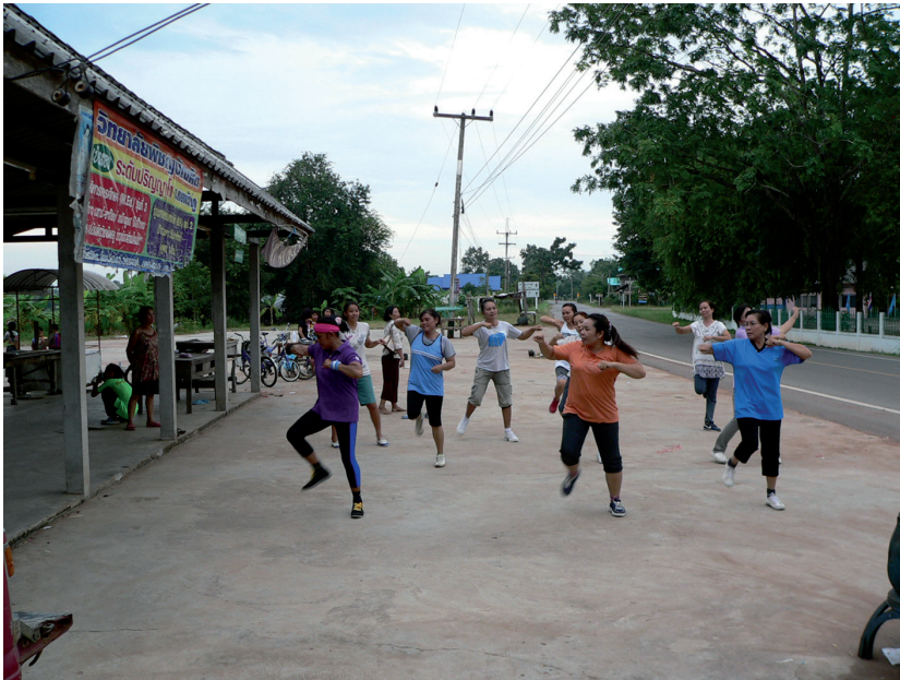
Fig. 4. A session of aerobic in Ban Han, 2014