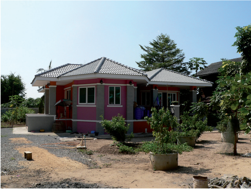
Fig. 3. A thian samai , Ban Amphawan, 2014