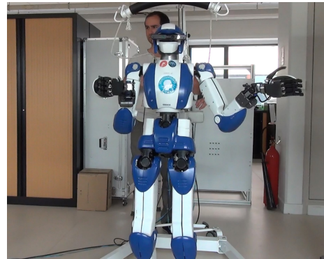
Fig. 3: Real robot tracking

In the subsequent offline motion tracking phase we use the motion tracking formulation (13) and update E_1 , E_2 , and (13) whenever the time t reaches the next event timing t_j along the sequence.