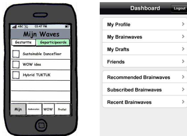
Fig. 10. A paper prototype or a user interface sketch (left) to present test-users or other designers what a design will look like. On the right a clickable prototype to present the interaction design or user-system dialogue of a smartphone application.

Media products tend to allow for much flexibility because of the distinction between the 'front-end', the website or user interface of the system and the 'back-end', the database(s) and the Content Management Systems (CMS) which act as the user interface of the application programmer.