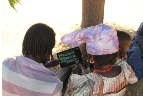
Fig. 1. Dialogue on a prototype.

Through introductions made by local researchers in Namibia we have since 2009 worked closely with a community of the Herero tribe located in the Kalahari Desert. The tribe has traditionally been pastoralists in the rural areas of Namibia since settling down (17th and 18th century) in the region. Our approaches to help the community preserve their cultural heritage have been approved by village elders, whom traditionally have decision power in the community and custodians of the IK. Until now the research has been directed to investigating and prototyping possible approaches in creating a system for preserving IK, which is co-designed through methods of PD and where all phases in the development are negotiated locally. Fig.1 shows the evaluation of a prototype running on a 10.1 inch Motorola Xoom tablet.