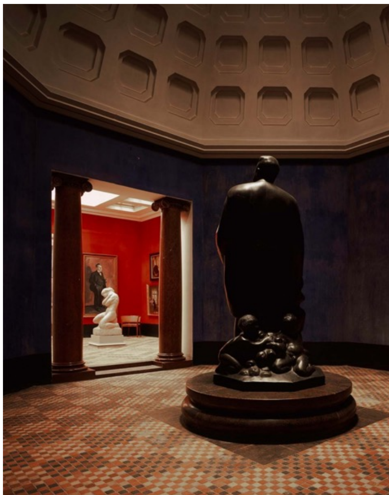
Figur 3. Faaborg Museum.

social situation. Atmosphere is then a mental thing, an experiential knowledge that somehow is stretched out between the object and the subject (Pallasmaa 2012: 20).