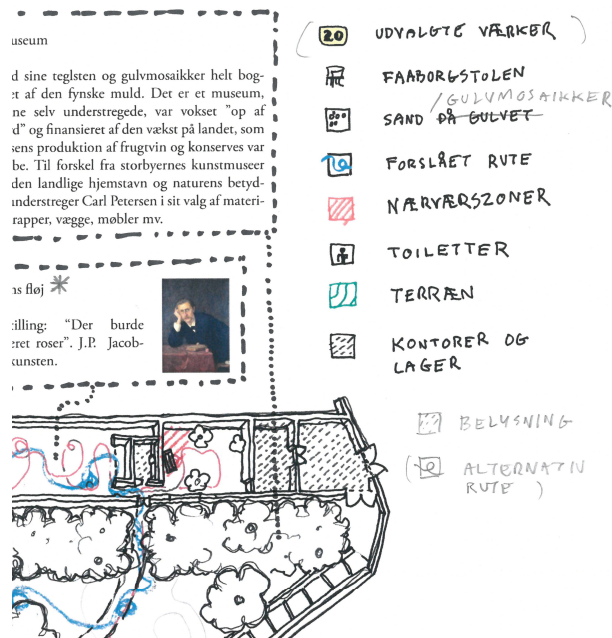
Figur 2 Second draft of the map (detail)

A map of potential presence zones must necessarily involve movement because embodied experiences of atmosphere and presence are situated in a body moving through space. British anthropologist Tim Ingold's notion of the meshwork might serve as a means of studying the museum as a particular place for walking, thinking, and talking. Ingold distinguishes between two types of motion, along and across (Ingold, 2007: 84-102, Ingold 2011). When walking in nature as well as in the museum we walk along a path and a terrain. We walk along works of art, museum objects, and the museum space. The stroll is essential to every museum walk.