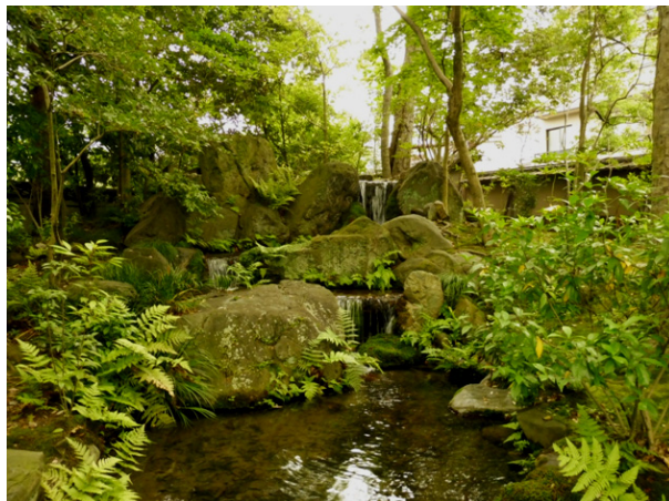
Figure 5. Facing the three-tiered waterfall. Photo C. Szántó, June 2015.