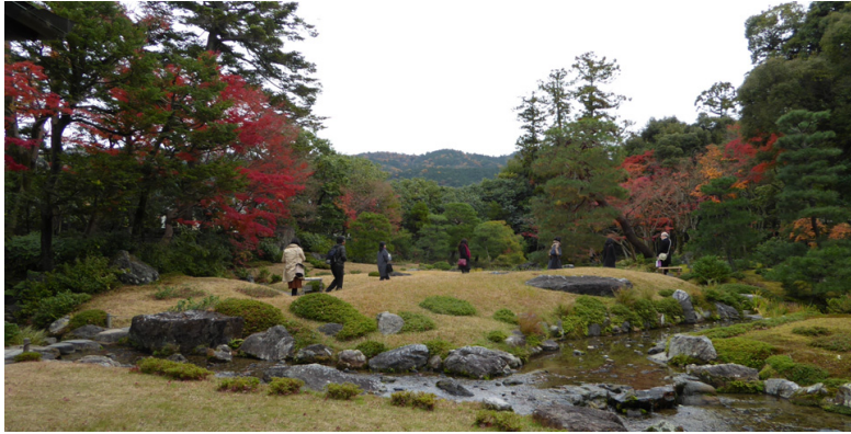
Figure 2. View of the garden from the villa, with the Eastern Mountains in the background. Photo C. Szántó, November 2015.

present in every part of the garden, the design of the paths (and particularly the paths accessible to today's visitors) is such that it cannot be experienced as a continuum but only as a succession of visual and sonic punctuations. The movement of water allows for the creation of many sound-making devices, such as the large three-tiered water cascade at the farthest end of the garden, stones and water-steps deliberately placed in the lake – and streambed. Each creates a specific sound that can be defined as so many distinguishable 'sound objects' (Schafer, 1977). As visitors moves through the garden, one 'sound object' will become audible while the other will fade away. Sometimes visible from the path, sometimes hidden or partially hidden by landform and vegetation, these sound-creating features qualify the ambiance of the space in which they are heard. They also create distant spatial appeals (over there) that complete and articulate the polysensory experience offered by a given space at any given moment (here). Of course, the way they are heard depends on the specific conditions on the day of the visit: the atmospheric conditions, the seasons (including the seasonal sound of animals, such as the summer cicadas), but also the sound of the heavy traffic from the road outside the garden.