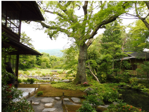
Figure 3. Path proposing a choice between a visible goal (view of the bright clearing) and a hidden one (sound of a small waterfall). Photo C. Szántó, April 2015

As we move forward on the stepping stones of the path, we suddenly reach a larger stone. It is a traditional marker for a place where a path divides. Here we have to decide whether to turn left and continue toward the clearing, or turn right and step down towards the river and try to get a glimpse of the sound source.