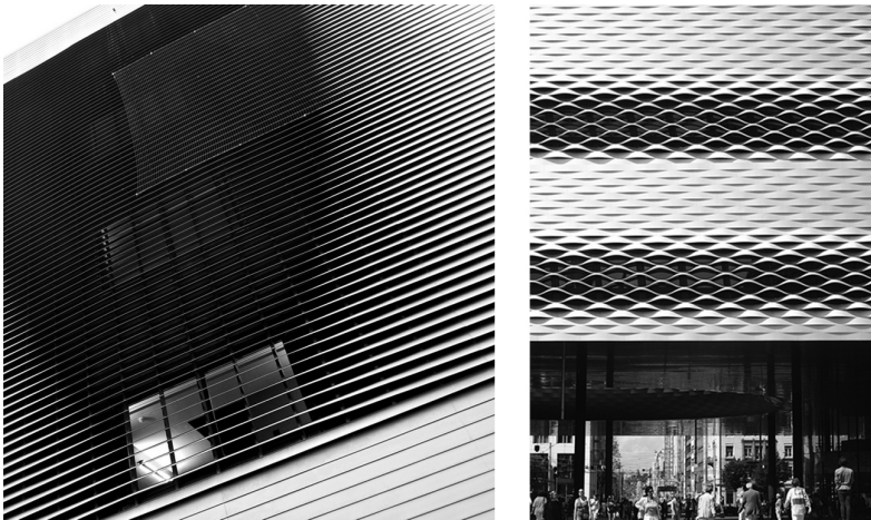
Figure 2. Screen façades by Hertzog & de Meuron in Basel: Central Signal Box, 1999, photograph by Theo Jones (left) New Hall of Messe 2013, photograph by Trevor Patt (right)

The screen as adorned surface lies in conflict with the modernist tradition that champions the purity of volume. Nevertheless, in its permeability and lightness, the architectural screen supports the Modernist emancipatory quest for dematerialisation of architecture through light and transparency (Buchanan 1998). The development of curtain wall facades and sophisticated cladding systems – apparently reconcile this conflict. According to Gerhard Mack (2000) in terms of function and imagery, the façade fulfils the role traditionally assigned to ornament and decoration, acquiring certain autonomy as an interface between the building and the outside world, comprising simultaneously a space and a surface. The interaction between the volume and the surface that conceals or reveals it is evident in many of the pioneering works of Hertzog & de Meuron where the façade functions as a “phenomenological structure” and as a “pictorial skin” (Mack 2000).