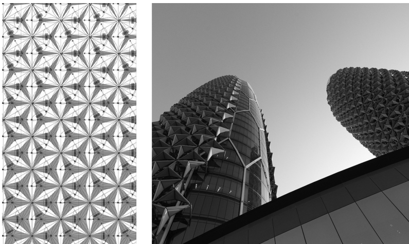
Figure 3. Al Bahar Towers solar-responsive dynamic shading screen in Abu Dhabi: Grasshopper definition of folding patterns by Wissam Wahbeh (left) photograph by Still ePsiLoN (right)

design generative parameter, the representation and manipulation of ambiance in architecture has drastically accentuated with the use of digital media in the design process as light, acoustic, and climatic behaviour of architectural form and fabric can be efficiently modelled, simulated and calculated. Dynamic façade systems are investigated in a cross disciplinary field between architecture, robotics, artificial intelligence, and structural engineering, highlighting the geometric and structural aspects of surface kinematics. Complementary, at the scale of the interior digital artisanship is expressed in machine intricate ornamentation of surfaces amplifying perceptual effects. This new kind of surface calibration that accentuates its responsiveness focuses upon a microscopic rearticulating of its texture revamps the relation between architecture and the primary craft of the textile. In fact, this cyclicity in the development of the surface paradigm in architecture re-assesses Gottfried Semper's theory of the origin of architecture in textiles.