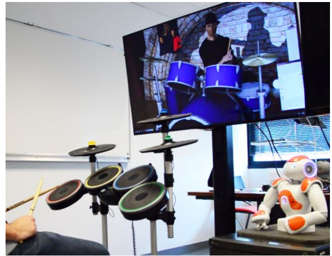
Figure 1. The interactive system: a Xbox Drums Band controller, a Nao robot and one of the MARC toolkit virtual agent on a virtual drum.

Xbox MadCatz “Drums Band” controller. It is composed of 4 drums and 3 cymbals, plus a central kick pedal.