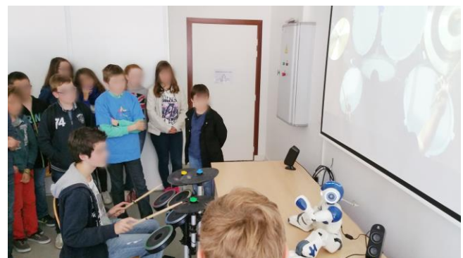
Figure 3- Photo of a class of 12 y-o children discovering the virtual drum teacher (faces blurred for anonymity). In this class, we used a projector instead of a TV.

Our second informal test was conducted on older children, 11 and 12 y-o (fig. 3). This time, most of the child were strongly engaged in the task for the entire duration and all exercises were successfully finished.