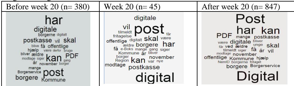
Figure 7: Tag clouds of articles

A cross-check in the InfoMedia base in relation coverage on Digital Post in National and Regional newspapers in week 20 shows a different pattern. National newspapers had only 3 articles the particular week and Regional newspapers had 24 articles. The coverage in Regional newspapers differs substantially from the local coverage. The Regional newspapers have in general very negative headings e.g. "Digital terror", "Digital disadvantages", and "More Citizens will opt out". The majority of articles are letters to the editor where citizens air their frustration. In comparison do the Local newspapers have headings such as "Join the Internet café" and "Workshop on Digital Post", reflecting a helpful and cozy atmosphere. The articles are with no exception written by the journalists affiliated with the newspapers.