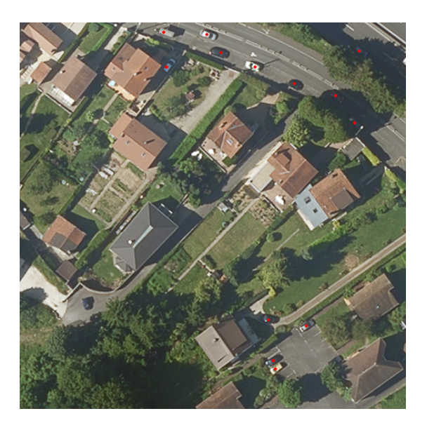
Figure 3: Illustration of pointing dataset: ground truth is the set of object centres