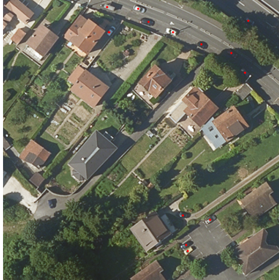
Figure 3: Illustration of pointing dataset: ground truth is the set of object centres