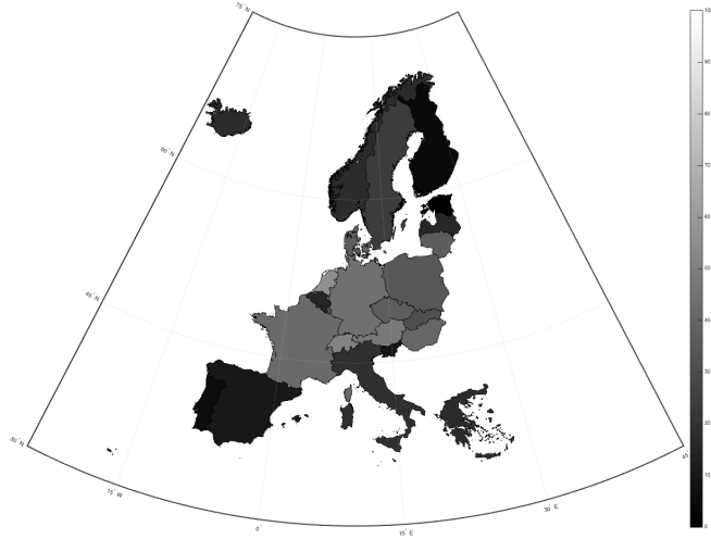
Fig. 1. Schengen routing compliance levels

To determine the geographic location of an IP address, Maxmind's GeoLite database [10] was used, the same database as was used for the AS selection process described in Section 3.2. Figure 1 provides an overview of those results found. Light gray shades represent higher Schengen routing compliance levels while dark gray shades stand for lower compliance levels.