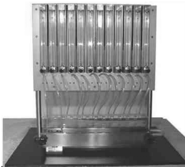
Figure 2. Picture of continuously perfused Ussing chambers, http://www.kmsci.de/Ussing/ussing.html . The chambers are the same as in the circulating chambers. However, the buffer is continuously perfused to the chambers from reservoirs situated above the chambers.

perfused chamber, the solutions bathing the two sides of the tissue are delivered from reservoirs mounted 20–50 cm above the chambers via polyethylene tubes. Valves are used to regulate the flow rate. In both cases, temperature can be adjusted by means of a water jacket heating system.