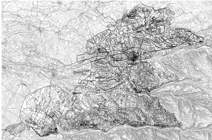
Figure 2: The perceived geometry

interpreted through the elements that configure the complex geometry of this landscape, as for example the parcelary and the irrigation channels, extracted from the 5,000 topographic database and the agricultural margins, the geometrical configuration of the agricultural crops and the drystone walls, mapped manually based on the observation of the ortophoto. The innovation of the approach lies in the interpretation of these elements according their contribution in the sense of the embodied experience in terms of their density, orientation and rhythm.