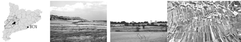
Figure 1. Situation of the landscape unit and representative images

The preceding argument takes as point of departure the landscape unit of Secano de Belianes i de Ondara, as delimited in the landscape catalogue of the region of Lerida, Catalonia (Nogué i Font J; Sala i Martí P; Departament de Política Territorial i Obres Públiques (eds.) 2010). It is a plain agricultural landscape, essentially ordinary, whose particular "beauty" is far distant from archetypal prototypes linking atmosphere to sublime landscapes. What makes this landscape different from any other plain rainfed mediterranean landscape? As it will be argued, the specificity of this landscape can be, at least partially, identified when cartography interprets its properties through the embodied experience.