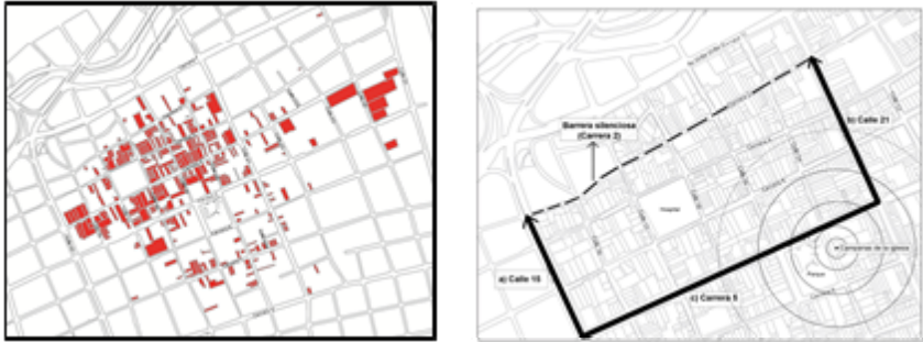
Figure 1. Density of printing businesses in the neighbourhood, 2015. Figure 2. Acoustic territory.

and social dynamics. Listening time slots on the three streets were chosen by taking into account the principal moments of transition between 7:00 am and 7:00 pm and were held two days a week (Tuesday and Friday) with different business dynamics, as reported by the interviewed workers. In the listening sessions, the most frequent sounds were systematically counted, excluding those of traffic. The work resulted in a list of 23 ‘sound objects’ 1 from which 5 were considered to be the most frequent: a) the pounding of printing machines, b) the rubbing of the door or metal shutter that closes the premises, c) the rolling of the carts carrying supplies, d) the recyclers and vendors’ trolleys and e) the music that, from radios and audio equipment, accompanies the daily life of the sector.