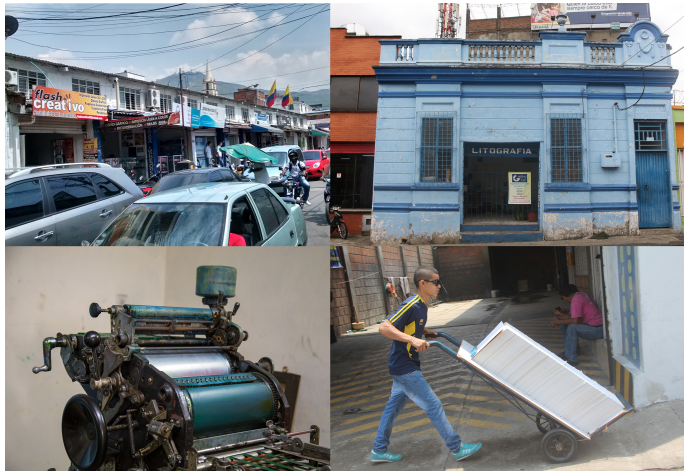
Figure 4. The neighbourhood of San Nicolás

San Nicolás is an exceptional space because, in addition to its historical roots as a traditional neighbourhood, it has established more than a century of activity, a cluster around the art of printing (Figure 4). The job of the printer has changed its craft since printing was done with two types until the current digital technology that obviates the craft and mutes its mechanical operation with plotters and laser printers. The 527 businesses concentrated in 20 blocks form an acoustic territory, which contributes to an environmental identity that still survives among the sound of traffic.