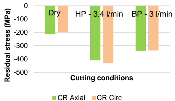
Figure 3: Residual stress

The last part of this study focuses on the influence of liquid nitrogen parameters on surface residual stress. Indeed, in dry machining the level of residual stress does not exceed -200 MPa. However, it reaches -330 MPa at low pressure (3 l/min) and -433 MPa at high pressure (3.4 l/min). Figure 4 shows these results.