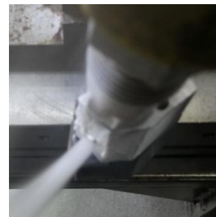
Figure 1: New nozzle holder

A new nozzle holder has been specially developed for this study (Figure 1). It allows the positioning and the supply of calibrated nozzles of different diameters.