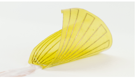
Figure 5: Unimorph-based petal [17].

Another approach to provide shape-changing devices are alloy based systems . By using a combination of metals with different thermoelectric characteristics, composites can create flexible shapes actuated by either environmental temperature changes or active heating. The most paradigmatic example in HMI is surely uniMorph [17], a technology for rapid digital fabrication of thin, reversible shape-changing interfaces. Using this technology, authors implemented several example prototypes, such as a flower lamp that blooms to reveal light (see Figure 5), a bookmark that detects darkness and curls up to provide light to the reader, post-it notes that curl up depending on their content, or an iPad cover that opens with different angles to indicate a message arrival.