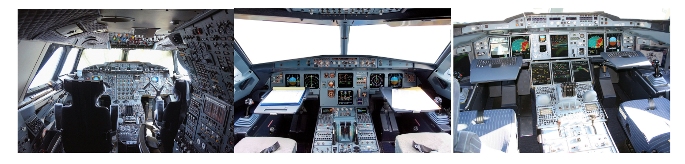
Figure 2: Types of cockpit. Left: Concorde's analog cockpit; Center: glass cockpit in the A320; Right: interactive cockpit in the A380.