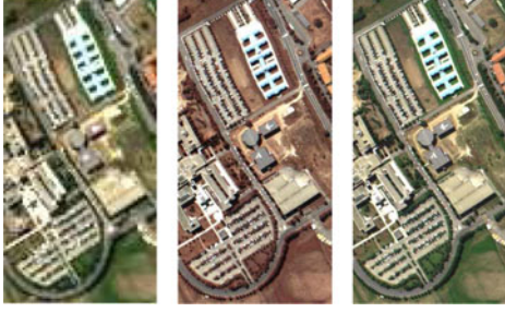
Fig. 1. Pavia dataset: (left) HS image, (middle) MS image, and (right) reference image.