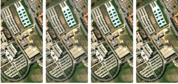
Fig. 2. HS+MS fusion results. From left to right: (1st) FUSE using Gaussian prior, (2nd) R-FUSE using Gaussian, (3rd) FUSE using TV, and (4th) R-FUSE using TV.