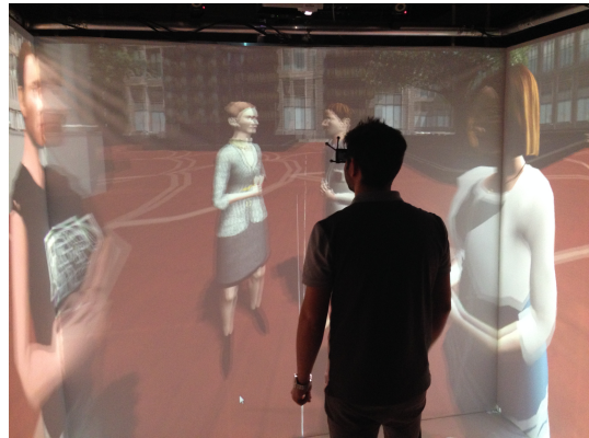
Figure 2: Experiment setting. The users must maintain their position however they are free to look around.

We invited participants in the CAVE and explained to them the study's procedure while already wearing the glasses for 3D vision and the head tracking system. We showed a tutorial where all agents were expressing neutral attitudes. We used life-sized agents that, at the beginning of each condition, placed themselves in a circle in order to include the participant and then started the simulated conversation (see Figure 2).