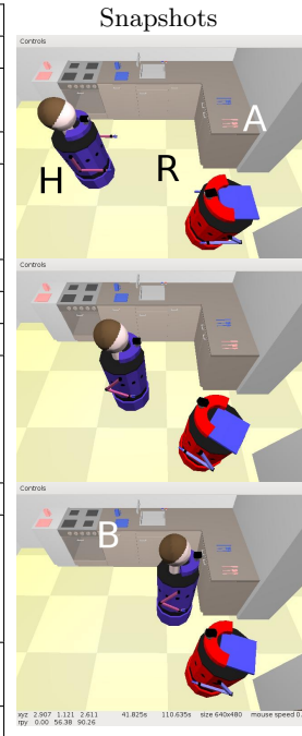
Fig. 3: Logfile and snapshots showing opportunistic change of intention due to spatial circumstance. At time 588 the robot R decided to next pick item SPOON-BLUE shown as location A, and at time 597, the robot instead decided to pick item CUP-BLUE at location B, EVEN though SPOON-BLUE was still closer given Euclidean distance, but has higher path costs due to the human H having moved.