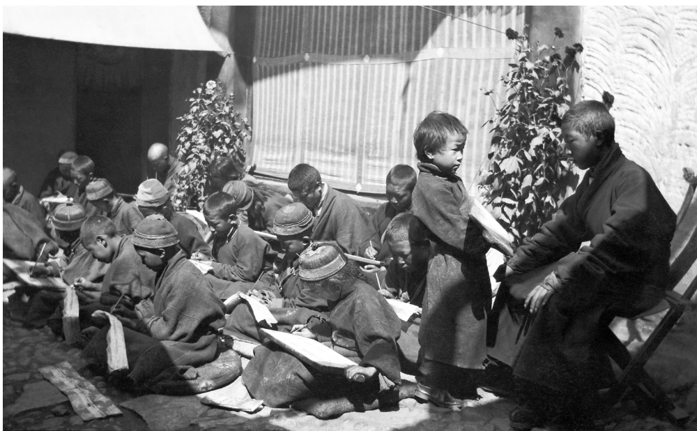
Figure 1. School at Lhasa, 1922, photograph by Charles Bell.

Outside Lhasa, there were schools of smaller size in the biggest urban centers, as mentioned above, but also in