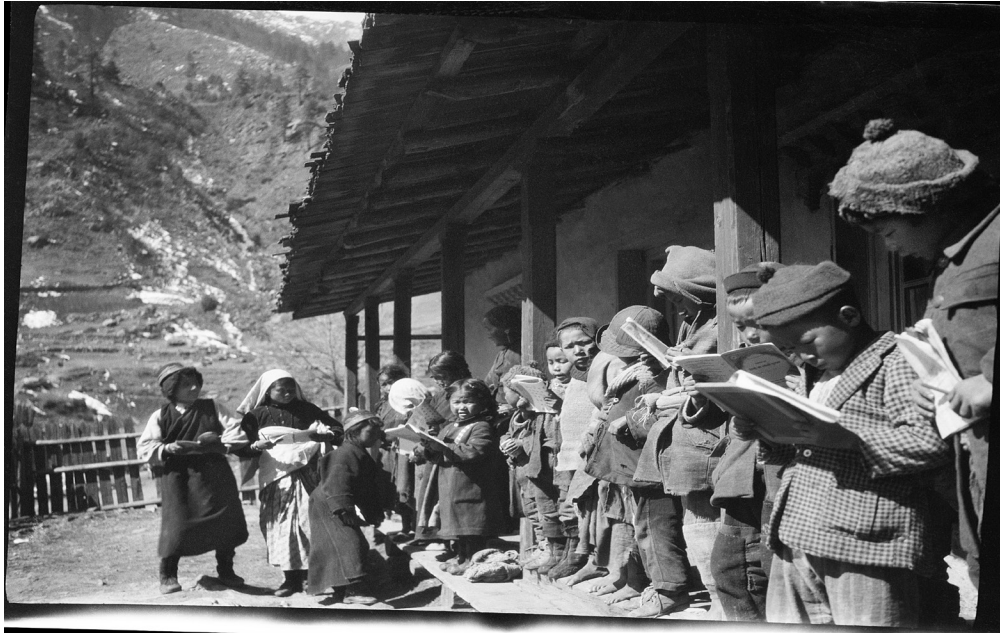
Figure 2. School children at Yatung, 1926, by A.J. Hopkinson.

(BMH.A.92.1, © The Trustees of the British Museum)