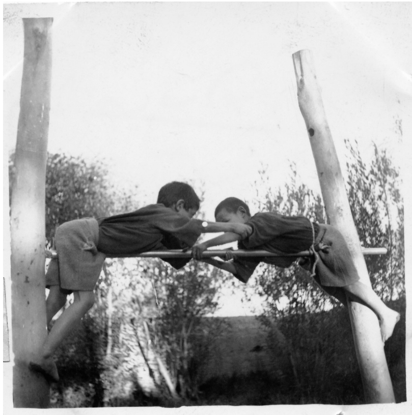
Figure 5. Sports at the Pala School in Gyantse.

(P303215, © Tseten Tashi, Photographic Archive, LTWA)