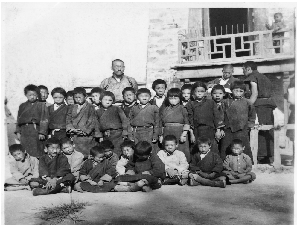
Figure 4. Children at the Pala School in Gyantse in 1927.

In this end of 19th and early 20th century Tibetan context, ‘private’ did not mean exclusive, since most of these private schools were open to girls and boys, and in particular to commoners’ children, with the exception of a few that were only open to particular groups, like the military (Suo qiong 2011: 111). The students were thus children of noble families, but also nephews and disciples of monk officials and monastic officials, children of merchants and secretaries in the lay and monk and treasuries government offices, as well as children of servants to noble families (Khri zhabs zur pa Nor bu chos ‘phel 2009: 52). 45 Some sources speak of an “elite oriented education” (Qangngoiba 2005), but when figures exist regarding the proportion of sons of the aristocrats compared to commoners, they show how numerous the latter were: to take the only example we have, at Yulkhagang School described by Bell and which a member of the Pala family attended in the 1920s, there were about thirty children of whom eight were sons of gentlemen and the remainder of the lower classes (Bell (1928) 1992: 105). These lower classes, as several observers have underlined, were made up of the urban middle class, and the upper social levels of the rural communities i.e. children of