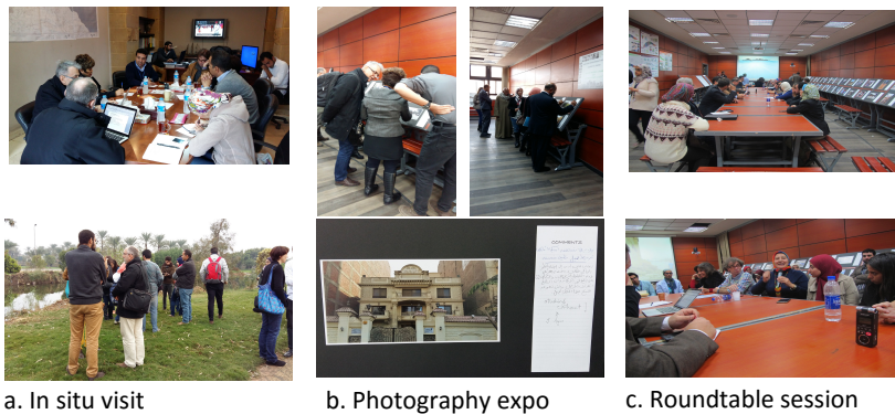
Figure 2. Photos showing the three sequential immersive experiences

The seminar and workshop were multidisciplinary and inter-sectorial. Students, professors and practitioners (on the international level coming from Brazil and France) as well as representatives of different ministries and local authorities were invited together with inhabitants and NGOs. Defining the ambience along Al-Maryouttia Canal was tackled via three sequential immersive experiences (Fig. 2): first, in situ visit guided by the NGO; second, two days interactive photography exhibition. This exhibition is a result of a two-week workshop with the students of Architecture and urban design departments in Ain Shams University. Photography is chosen to represent the ambience in a form of postal cards where a space for comments was left (Fig.2b). Attendants were asked to comment their perception scripturally. This type of engagement creates a second shared experience among visitors forming a base for the discussion during the roundtable, which is the final immersive experience that was a three-hour bilingual debate (Arabic-French).