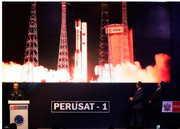
Fig. 1 Launch of the first peruvian remote sensing satellite PeruSat-1 viewed from the CNOIS (Centro Nacional de Operaciones de Imagenes Satelitales – National Center of Satellite Images Operation) in Pucasana – Peru via a big screen.

By the above reasons, the acquisition of this satellite system is a significant contribution to the development of the country, and we must be prepared to take advantage of all the information we can provide our images.