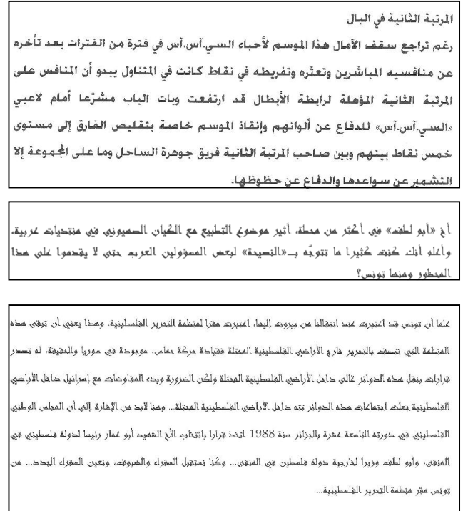
Figure 2. Examples of Arabic printed documents used in the "SmartATID" database.