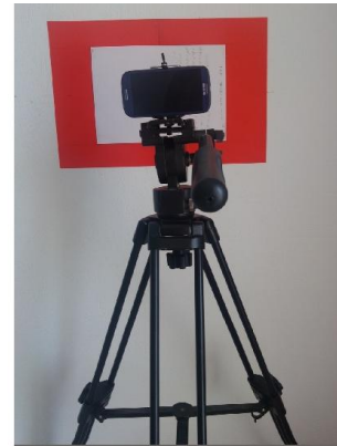
Figure 4. The rolling support holding smartphone over a document on a fixed simple background.

The sequence of steps dedicated to the capture is synchronized by a human so as to ensure the generation of digitized data in real situation. As examples of human interactions, we can mention: the manual change of paper document, of light conditions and the location of the focal distance from the smartphone camera and the center of the document page. Once a desired position and other capture conditions are achieved, the agent responsible to the image capture communicates with the smartphone through a Bluetooth to trigger the capture.