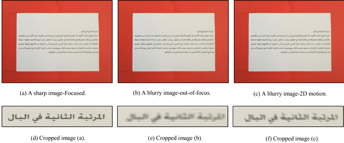
Figure 5. Examples of captured images for single distortions.