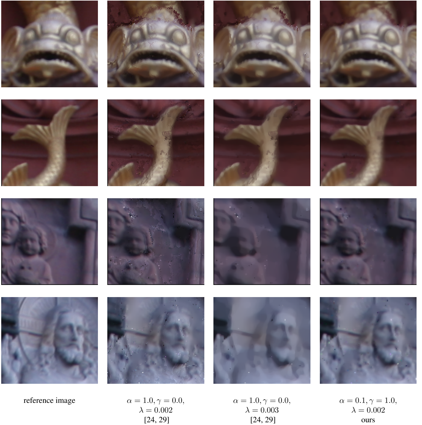
Fig. 5: Rendering the central view with different energy parameters. Each column shows the results on datasets fountain and herzesu [27] by applying a special set of parameters ( \alpha, \gamma, \lambda ) that control the amount of terms in the energy formula 17. Proposed approach is for \gamma \neq 0 . State-of-the-art approach [24, 29] creates high-frequency artifacts due to blending intensities only. A higher smoothness parameter \lambda = 0.003 partially removes these artifacts at the cost of detail loss. Our approach preserves detail and show finer results by appending constraints of the gradients of the solution, forcing a Laplacian blending.