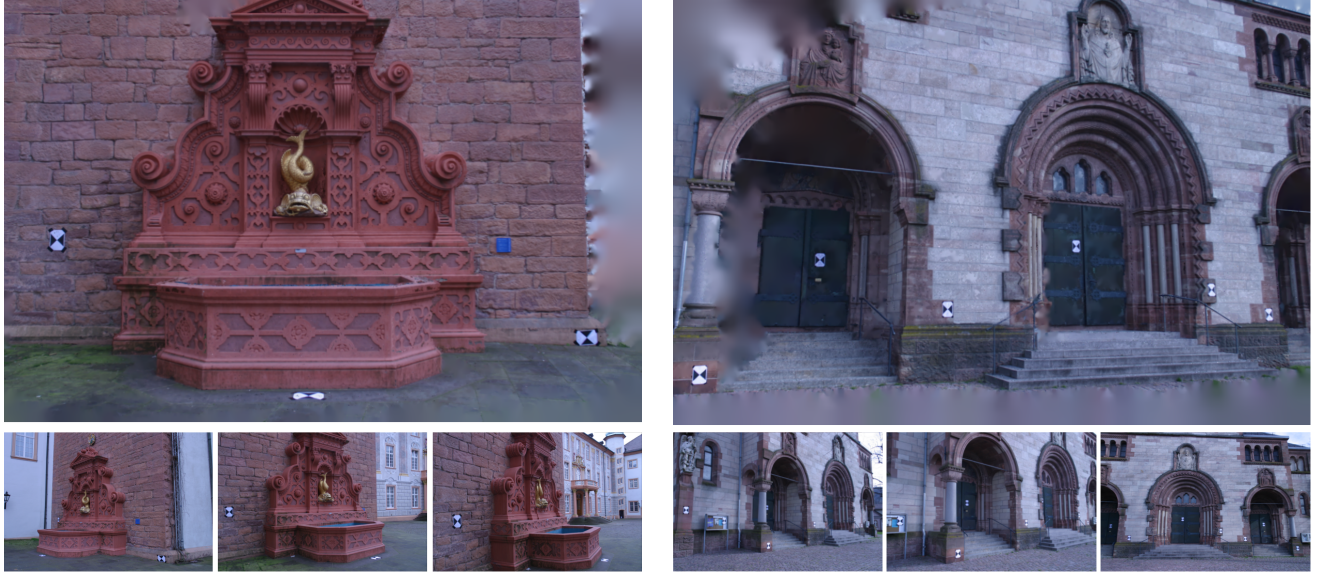
Fig. 4: Results on datasets fountain and herzesu . The bottom row shows some of the input views. Note that the parts of the target view that are not visible by any of the inputs are filled by a push/pull inpainting algorithm.

view. We use the depth to derive the blending weights as it is demonstrated in [24]. For further information about the reconstruction pipeline, more specifically occlusion handling and the derivation of the blending weights, see [21].