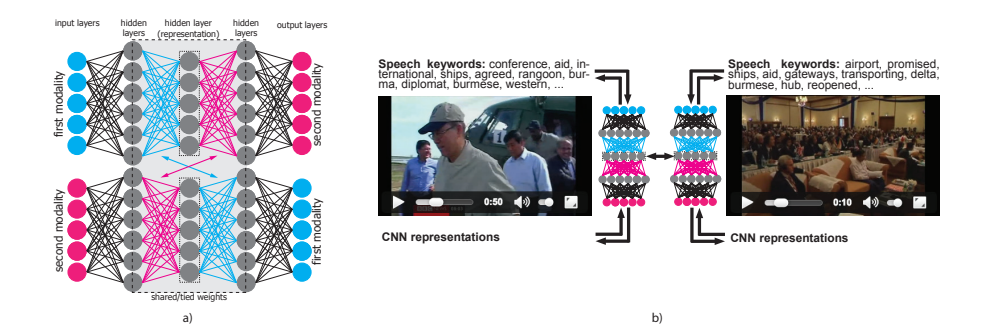
Figure 3: a) BiDNN architecture [8]: training is performed crossmodally and in both directions; a shared representation is created by tying the weights (sharing the variables) and enforcing symmetry in the central part b) video hyperlinking with BiDNNs [10]: both modalities (aggregated CNN embeddings and aggregated speech embeddings) are used used in a crossmodal translation by BiDNNs to form a multimodal embedding. The same is done for both the anchor and the target video segments. The newly obtained embeddings are then used to obtain a similarity score.

acts as a common multimodal representation space that is attainable from either one of the modalities and from which we can attain either one of the modalities.