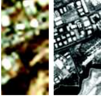
Fig. 1. Fusion results. (Top left) HS image. (Top right) MS image. (Row 2 left) MAP estimator [9]. (Row 2 middle) Wavelet MAP estimator [10]. (Row 2 right) MMSE estimator with known \mathbf{R} . (Bottom left) MMSE estimator with \mathbf{R} +noise. (Bottom middle) Proposed method. (Bottom right) Reference image.