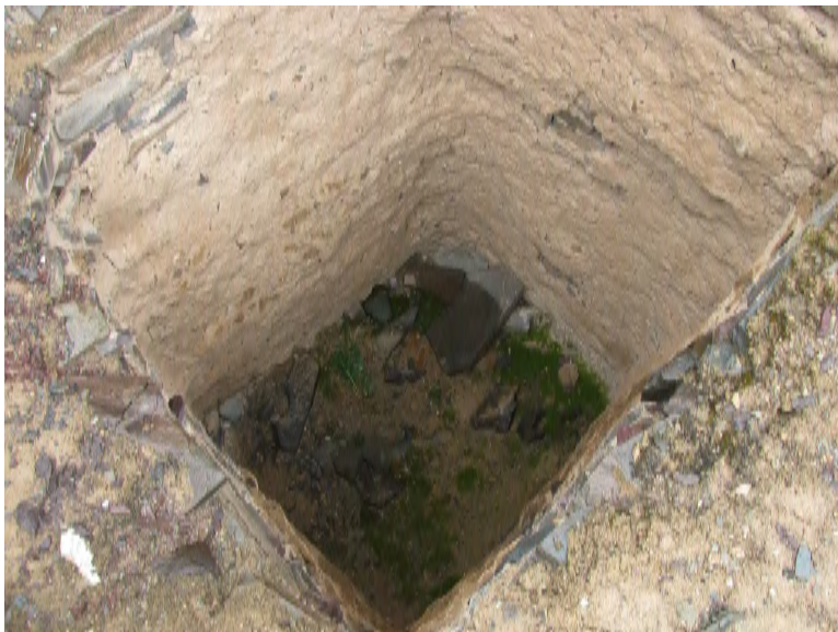
Figure 6: A larger box-like floor structure, possibly used as a storage silo. [Credits: Devers 2009]