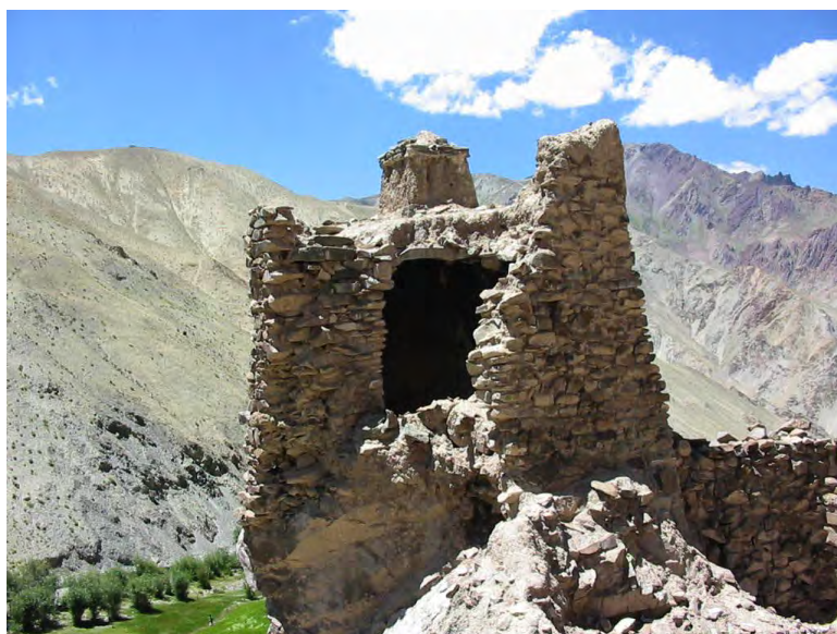
Figure 8: Tower at Rumbag.