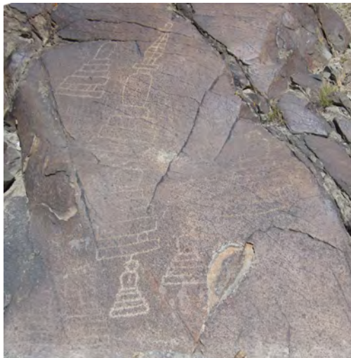
Figure 10: The group of engraved chortens located about a kilometre downstream from the fort. Some have obviously been retraced over.