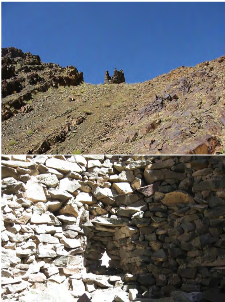
Figure 11: The watch tower at the valley's turn. [Credits: Vernier 2012]