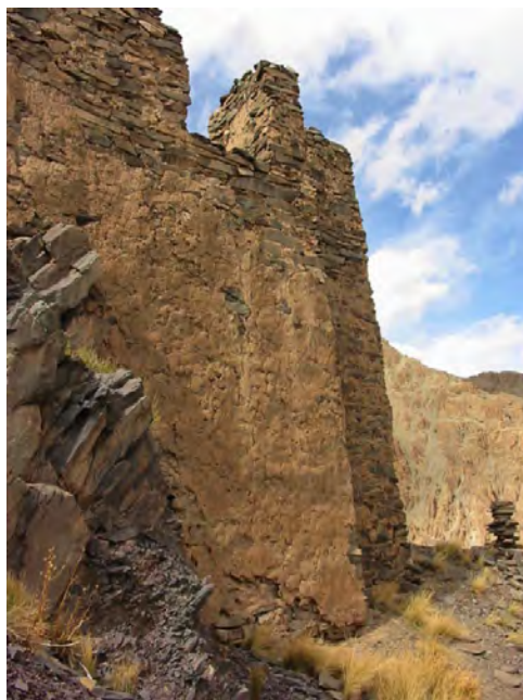
Figure 7: Building at the core of the complex.