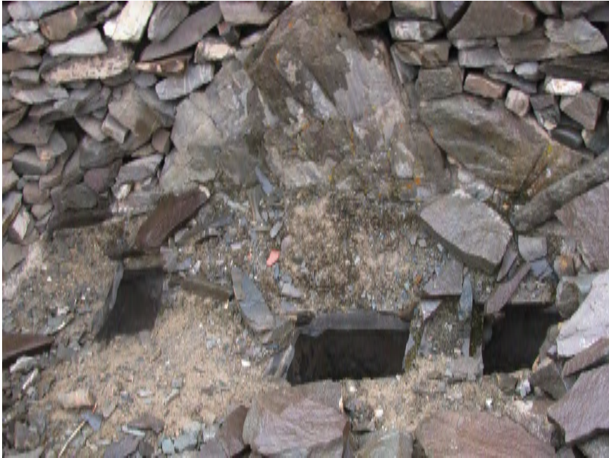
Figure 5: Detail of a box-like floor structure.