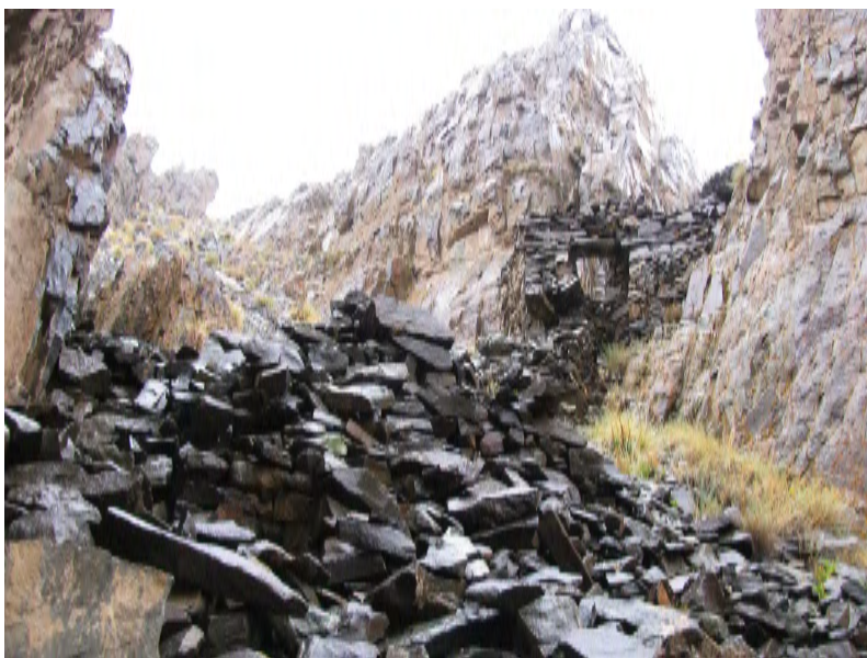
Figure 4: Protected stairways on the southern side. [Credits: Devers 2010]