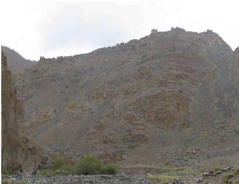
Figure 2: The north-eastern slope, towards Stok valley.