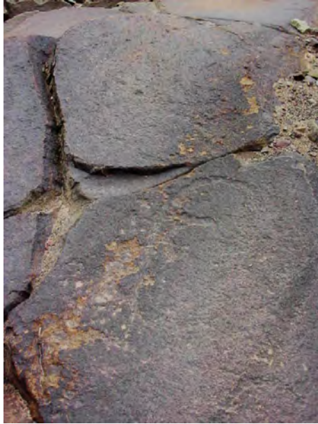
Figure 9: Petroglyphs at the feet of the fort. Here, two foot print motifs.