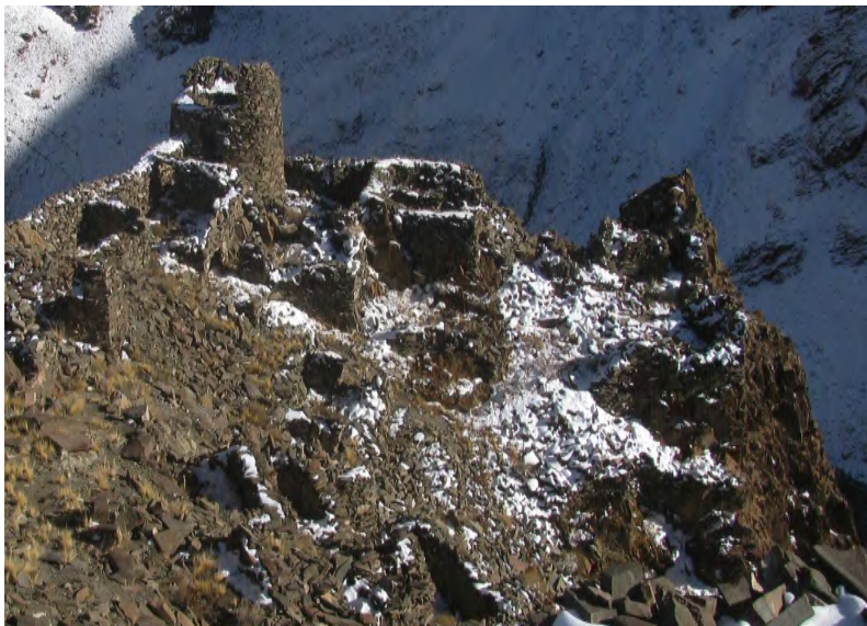
Figure 3: General view of the southern part of the side, facing south-east.