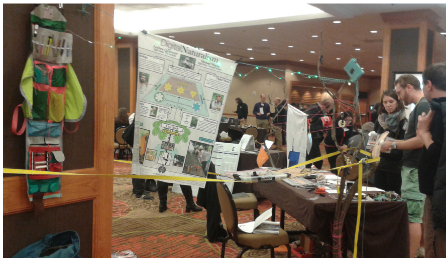
Paperworks, posters, tool kits... More than textbooks in the conference venue concourse.

The Programme as a whole offered concrete tools that sometimes work in tandem with educational projects. These tools aim at democratizing access to information and knowledge. For instance the “Solar Digital Libraries” 10 project (by Laura Hosman) focuses on populations with no electricity or Internet connectivity: a self-powered plug-and play kit (SolarSPELL) was designed to provide access to a digital library over an off-line WiFi spot, with areas struck by natural disasters in mind. “Civic Laboratory: Plastics” 11 is an action-oriented initiative at Memorial University of Newfoundland (Max Liboiron), which aims to create low-cost, open-source methods for monitoring environment and marine plastics. There is a description of do-it-with-others devices on the CLEAR website, which are designed by the people who use them (most of whom are not accredited scientists or engineers) and incorporate politics and values of feminism. This initiative tackles the major problem of oceans and marine pollution in a region (Newfoundland & Labrador) where many scientific protocols don’t work because of the extreme environment.