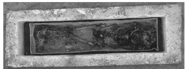
Fig. 2. South sarcophagus F293 with the individual in the lead coffin (photo: Archeodunum).

Only 1 individual yielded positive results. The analysis of sediment taken from the surface of the sacrum of the individual in coffin F293 (sample JC_FC_689, Table 1) revealed the presence of 2 ovoid eggs, characterized by 2 polar plugs giving them a characteristic lemon shape (Fig. 3). Egg sizes without polar plugs were 46.4 \mu m long and 25.2 \mu m wide for the first (Fig. 3A) and 54.5 \mu m long and 26.4 \mu m wide for the second (Fig. 3B). Because of the size (consistent with current data) and the archaeological context, these eggs were identified as