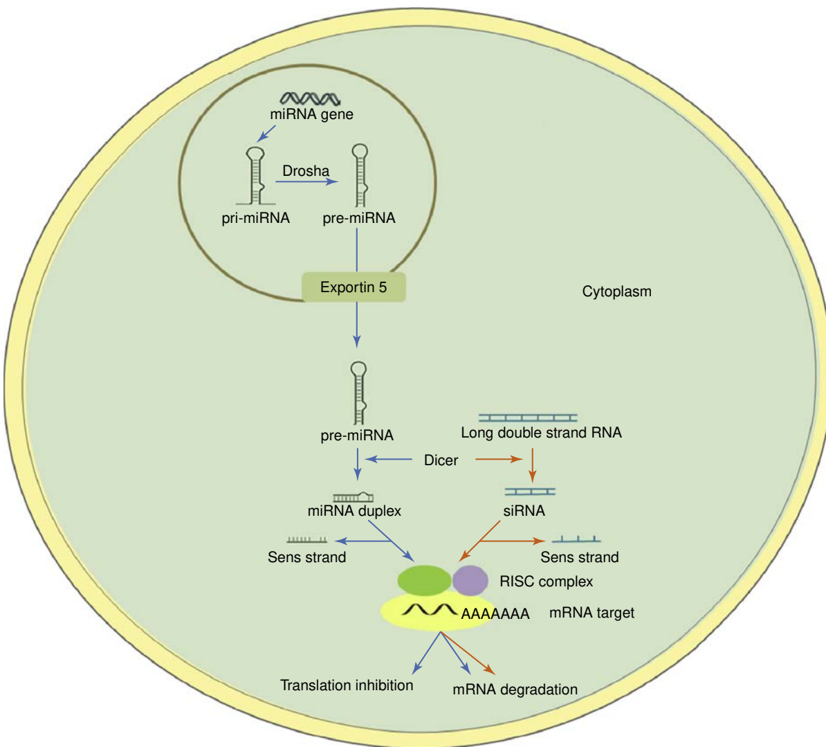
FIGURE 1 Mechanism of action of RNA interference (RNAi) by silencing RNA (siRNA) or micro RNA (miRNA) in mammalian cells.

complementary mRNA, which causes its degradation by the enzyme argonaute 2 (Ago-2) [6,7] (Fig. 1).