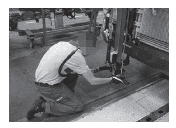
Fig. 2. Tightening screws at 'Mounting bumper on chassis' workstation caused awkward trunk and neck postures.

Operations for connecting or removing hoses, small parts, fasteners, and electrical connectors involved forceful hand movements and wrist bending. Unlocking the bumper lifting tool operation required such excessive force for fingers that these tasks were evaluated as double red. Immediate improvement was therefore needed and changes were recommended in the anti-lock system of the lifting tool in our further research. Furthermore, the majority of tasks at different workstations required using screwdrivers (weighing between 2-4 kg) which were vibrating tools with sometimes a forceful reaction at the end of tightening. All these operations increased the risk of musculoskeletal disorders for the hand/wrist. The same risk exposure pattern has been reported in other studies in the automotive industry<sup>22)</sup>. Recent studies showed an association between high levels of hand force, wrist bending and vibration with the incidence of carpal tunnel syndrome (CTS). In a cross sectional study a significant relationship was observed between hand force and CTS<sup>23</sup>).