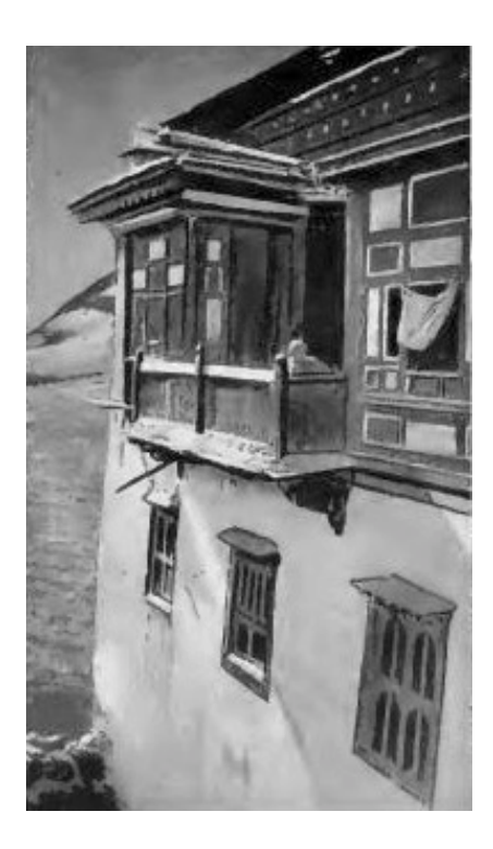
Figure 1. One of the forts ( dzong ) of the Tibetan chief in Ram ngön.

The part of the Drung Valley under Tibetan rule—the central and upper Drung valley, that is—was divided into nine territorial units (called shàp in Drung); for each of these units, two Drung representatives were chosen (gy\breve{o}ng-d\bar{a}q and nyvm-z\grave{a}ng ). The overall political organization and hierarchical levels were as follows: