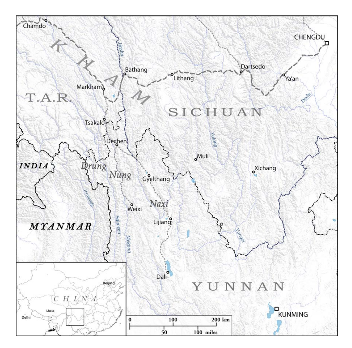
Map 1. Geographical location of the area of study and its main inhabitants (contemporary borders).

Republican periods, I explore the multiple allegiances that resulted from the competing interests of Tibetan rulers, Chinese administrators, independent chieftains, and religious authorities. In doing so, I hope to provide a fuller picture of the social, political, and cultural environment in order to understand the relationships among groups in the making of this culturally diverse area. This picture will shed light on a little-known history and on underresearched aspects of local cultures and transcultural flows, exchanges, and power relations.