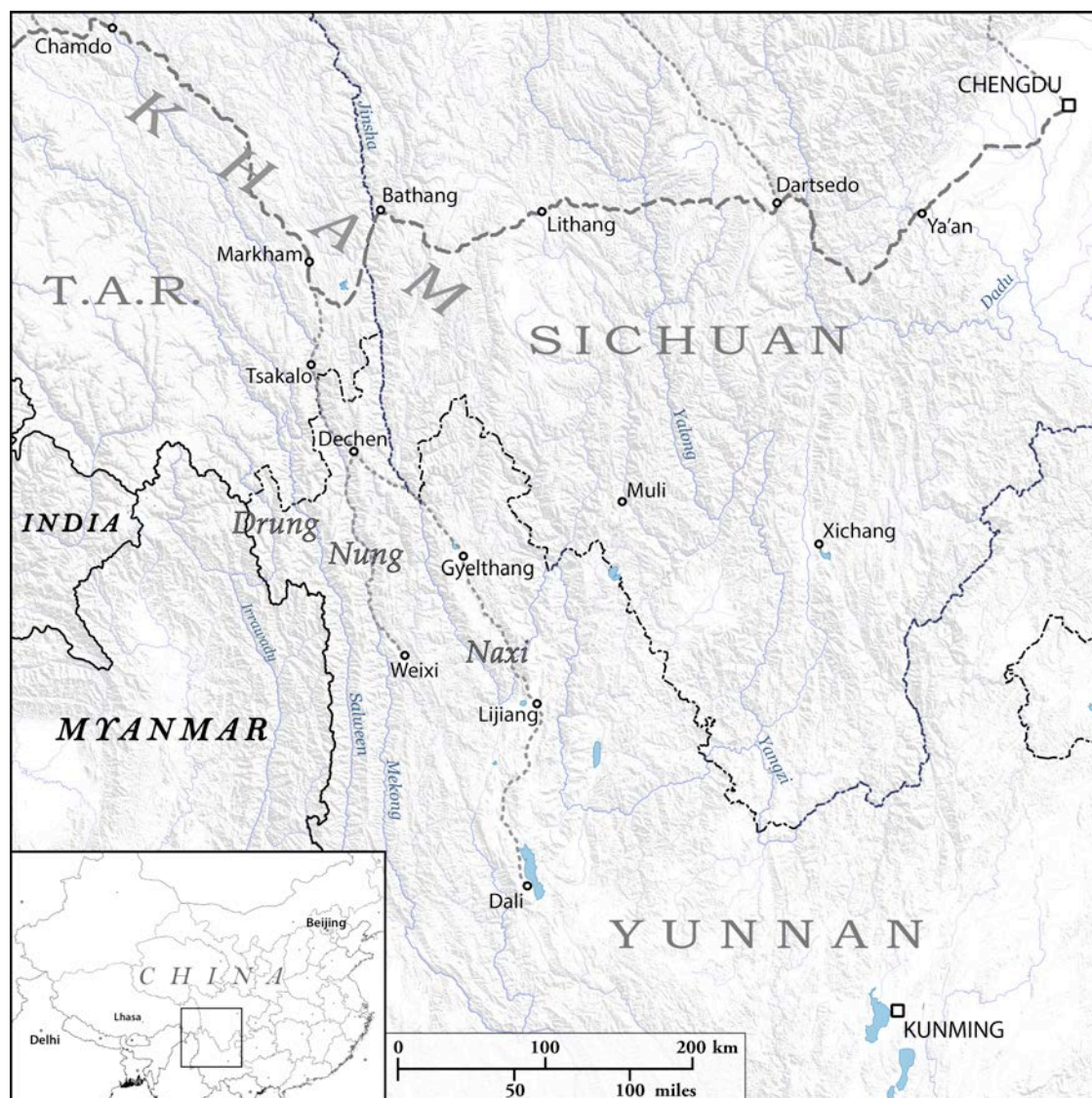
Map 1. Geographical location of the area of study and its main inhabitants (contemporary borders).

Republican periods, I explore the multiple allegiances that resulted from the competing interests of Tibetan rulers, Chinese administrators, independent chieftains, and religious authorities. In doing so, I hope to provide a fuller picture of the social, political, and cultural environment in order to understand the relationships among groups in the making of this culturally diverse area. This picture will shed light on a little-known history and on underresearched aspects of local cultures and transcultural flows, exchanges, and power relations.