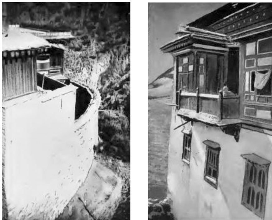
Figure 1. One of the forts ( dzong ) of the Tibetan chief in Ram ngön.

private profiteering and sometimes abuse. These rich merchants lived in very large houses (forts, dzong ) generally described by explorers at the time as big castles. There were two such castles, and the description that Jacques Bacot gives of the biggest one when he visited it in 1908 makes it sound very impressive ([1912] 1988, 248–250) (see figure 1). 24