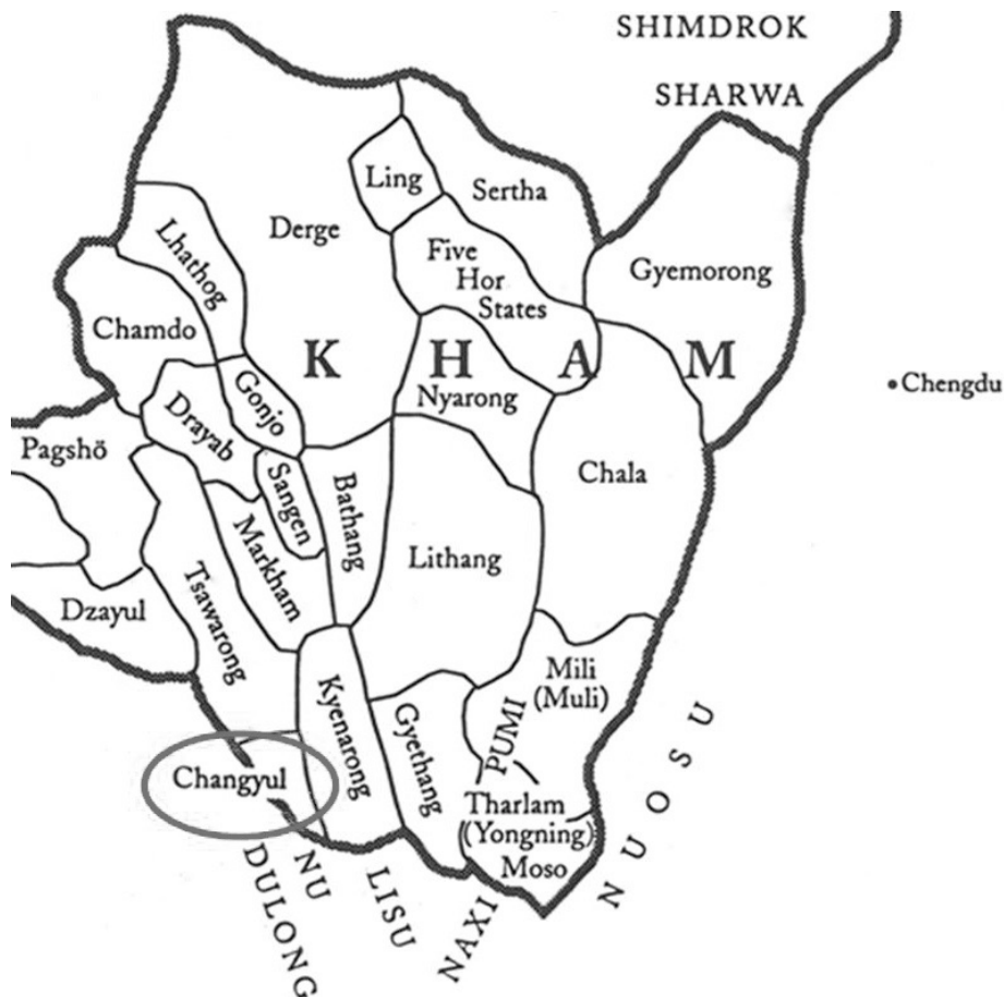
Map 3. Location of Changyul.