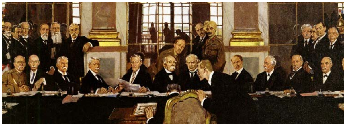
Freedom of movement was on the agenda at the Treaty of Versailles.

Versailles, which established the League of Nations, stipulated that member states commit to “secure and maintain freedom of communications and of transit”.