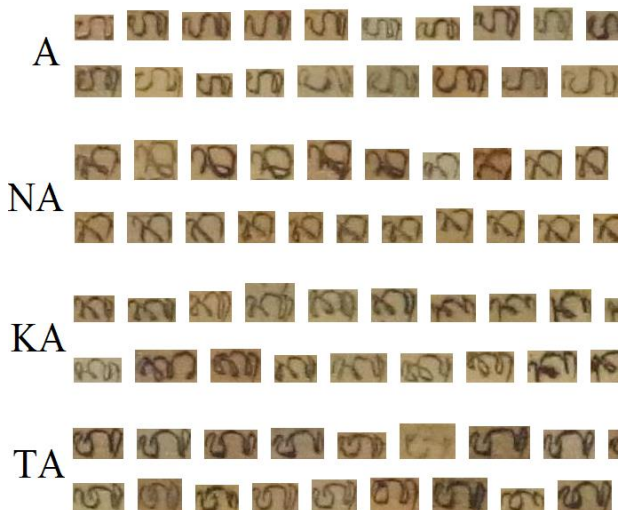
Figure 3. Samples of character-level annotated patch images

7,673 character-level annotated patch images as query test from 130 character classes have been provided. The number of samples for each classes is different. Some classes are often used in our collection of palm leaf manuscripts, but some others are rarely used.