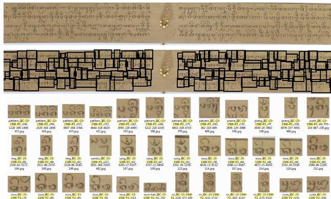
Figure 2. Original image and samples of the word-level annotated patch images

To create the word-level annotated ground truth dataset of the manuscript, we asked the Balinese philologists, the students in informatics, and the students in Balinese literature to work together to segment and to annotate the word in manuscript with ALETHEI 1 , an advanced document layout and text ground-truthing system [9]. The dataset is partitioned into training and test subsets. For the training subset, we have provided 130 original images and the corresponding 15,022 word-level annotated patch images (Fig. 2). For the testing subset, 100 original images (different from the training subset) and 36 word-level annotated patch images as query test have been provided.