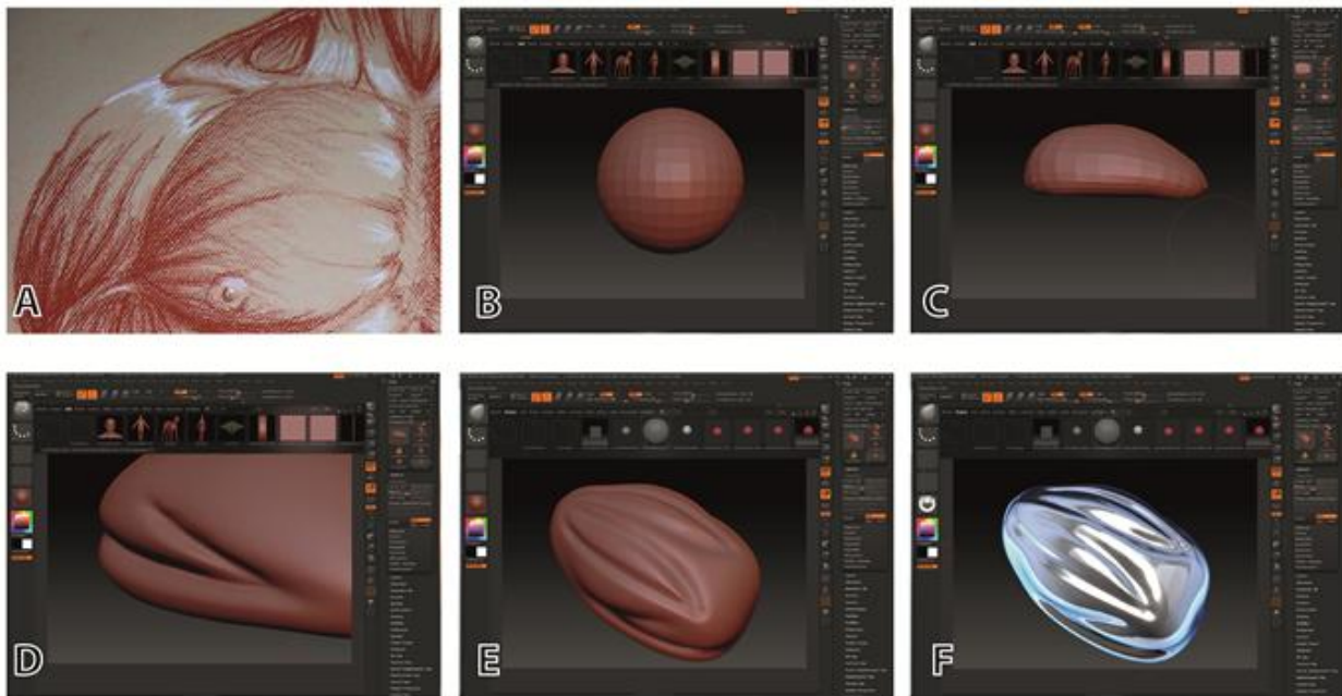
Figure 2. Six design steps of the 3D artist CAD tool: (a) muscle reference, (b) import a low resolution primitive, (c) raw deformation of the low definition primitive, (d) sculpting the ribs at low definition, (e) sculpting additional ribs at high definition, and (f) final result with chrome material applied.

Digital artistic design is a design process of congruence with the initial list, that is, the verbal brief or 2D sketched example, and extension , which adds a profusion of details to obtain a unique artifact, that is, to achieve a form of singularity.