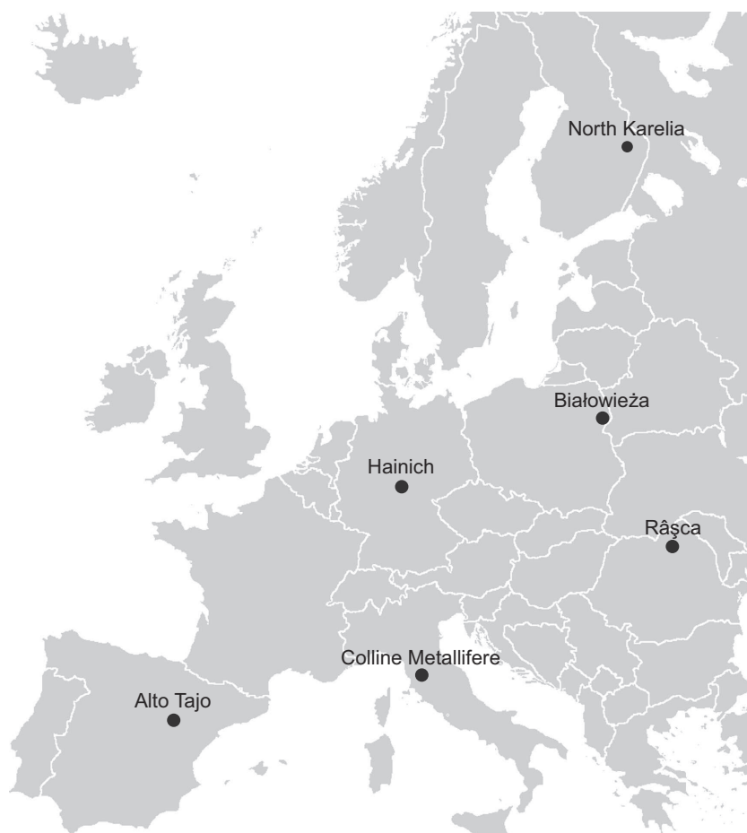
Figure 1. Map showing the location of the six sampling sites in the respective European country. See Table 1 for site and sampling details.

The study was conducted in six mature forest sites (at least in the late to mid-stem exclusion stage) in six countries, spanning six major European forest types (Fig. 1, Baeten et al. 2013). Sampling was conducted over approximately 2 weeks in each of the six countries during the vegetation period (June to August), in either 2012 or 2013. The number of plots sampled varied in each site