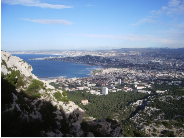
FIGURE 6 – Marseille from the National Park (Cresp, 2012).